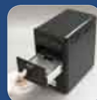
Plate is sealed automatically