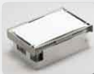
Figure 3: shows a 384well PCR plate with Peel-Seal positioned on plate carriers 4ti-0615 and 4ti-0625. The sealing frame is applied to prevent the seal from curling.