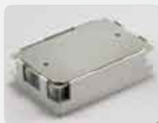
Figure 2: both plate carriers can be interlocked for easy handling of shallow well plates