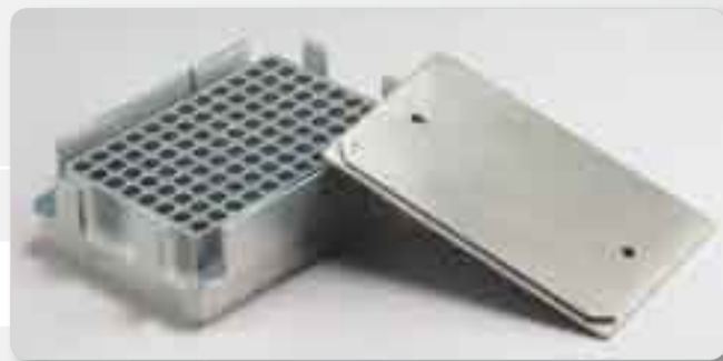
Figure 1: Standard plate carrier (4ti-0615) and the optional adapter for 96well PCR plates (4ti-0625)

For better sealing of those films which have a tendency to curl we offer sealing aids. A weighted platen (4ti-0602) for use with deep well blocks is provided with the unit and a sealing frame for use with all other plate designs is supplied when ordering the optional 4ti-0625 adapter.