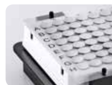
Align Random Access Seal with adapter