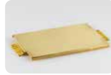
4ti-0602 Weighted Sealing Platen For use with deep well blocks