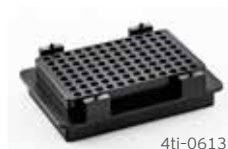
Plate Support Adapter, RA, Low Profile

4ti-0613 For low profile plates 4ti-0613-1 For low profile Break-A-Way plates