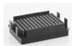
4ti-0625 Plate Support Adapter, PCR 96 For 96 well PCR plates