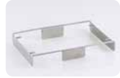
4ti-0612 Sealing Frame For use with 4ti-0625