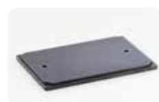
4ti-0615 Plate Support Adapter, Standard For skirted 96 / 384 well plates