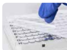
After sealing - remove seal backing liner