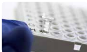
Random Access 96 Well Skirted PCR Plate (4ti-0960/RA)

For easy alignment, 4 pins are located on the adapter that the pinholes on the sealing sheets easily slide on to. Correct alignment can easily be checked thanks to the material between the seal spots being clear.