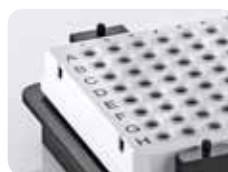
Place Random Access Plate on adapter