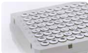
Random Access Pierce Heat Seal Strong (4ti-05381/RA)