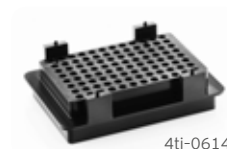
Plate Support Adapter, RA, Standard Profile

4ti-0613 For low profile plates 4ti-0613-1 For low profile Break-A-Way plates